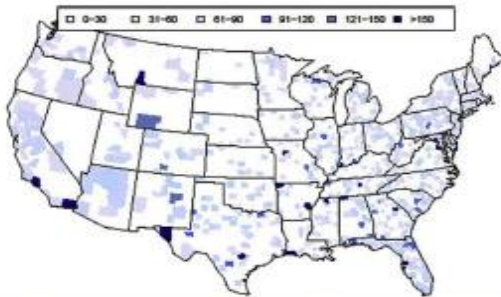
Fig 1. Intensity map demonstrating variation in median annual endovenous therapy (EVT) services per provider by county.

Conclusions: There is great variation in intensity of vein ablation procedures performed on Medicare beneficiaries that cannot readily be explained by clinical factors alone. The likelihood that a provider will